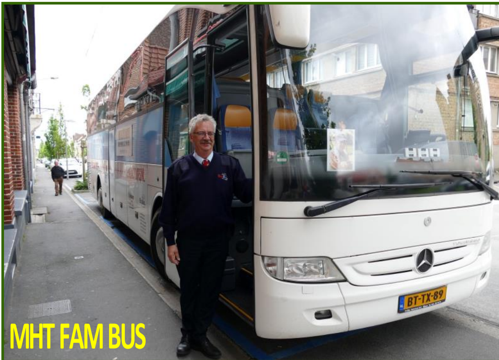
MHT FAM BUS

Day 2: Brussels: After arrival, we have early check in to the Thon Hotel Bristol Stephanie. Depart for an early lunch (Meli Delicatessen) on the way to the Royal Museum of the Armed Forces. Then we visit the amazing Autoworld with over a thousand+ vehicles. We finish the day at the Grand Place for dinner & some superior chocolate shopping. (D-Dinner)